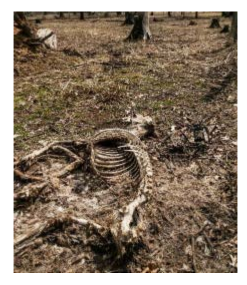
CWD prions that infect deer can be released into the environment. Researchers recently looked at how the prions interact with soil.

CWD has infected and killed deer, elk, moose and caribou throughout North America and has even been detected in South Korea and northern Europe. But researchers have had no luck finding a cure and continue to manage for the disease by attempting to stop its spread. Efforts to combat the disease have been further challenged by the ability of the prions to bind to soil and remain in the environment for years.